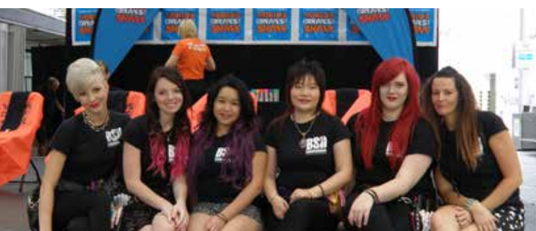
Shave for a Cure