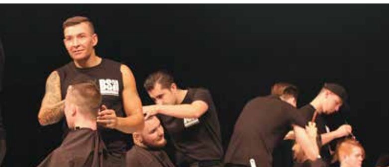
Brisbane Hair and Beauty Expo (Be-YOU-tiful Bar)

At AAHB our goal is to assist your progression at every stage of your chosen field. Our delivery is the ideal blend of theory, workshops, demonstrations and extensive practical experience in the student salons and clinic. Additionally we incorporate many other opportunities for our students that increase industry exposure, help build your portfolio and develop your industry network.