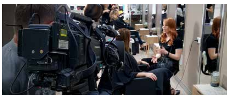
Movie shoots and organised events